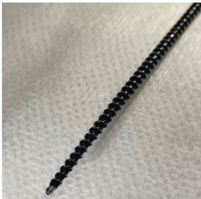
► Fig. 3 Image of the drill dilator. The tip of the dilator was gently tapered with a drill shape adapted to a 0.018- or 0.025-inch guidewire.

cessfully retrieved with no adverse events (► Fig. 2 , ► Video 1 ). Finally, we inserted a new pancreatic stent. This novel drill dilator was developed to facilitate endoscopic ultrasound-guided interventions (► Fig. 3 ) [5]. Because the device does not require strong pressing, excessive pressure against target organs can be avoided. In the present case, we completed the procedure without damaging the pancreas or inducing upstream migration of the pancreatic stent toward the main pancreatic duct. Furthermore, the dilator is thin-tapered and easy to insert. The technique described here using this thin-tapered drill dilator might be a useful option for removing a pancreatic stent.