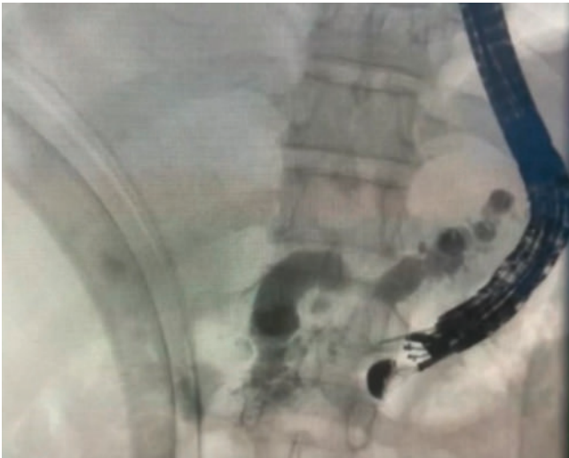
► Fig. 3 EUS-guided pancreatogram.