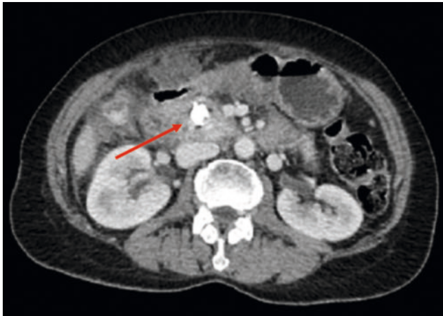
► Fig. 1 Pancreatic duct stone at the head of the pancreas on CT imaging.

the epigastric region. Biochemical parameters were notable for a deranged liver function test with total bilirubin, 2.3 mg/dL; aspartate aminotransferase (AST), 462 U/L; alanine aminotransferase (ALT), 241 U/L; and alkaline phosphatase (ALP), 136 U/L. Amylase levels were elevated at 686 U/L. Abdominal computed tomography (CT) revealed evidence of choledocholithiasis and pancreaticolithiasis at the head of the pancreas measuring 10 × 8 mm. (► Fig. 1 ).