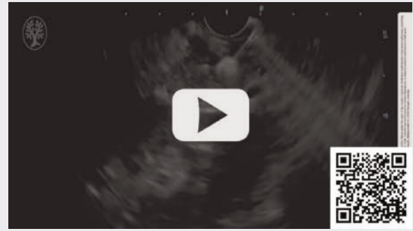
► Video 1 Pancreatic duct stone fragmentation.

The tip of the needle was then redirected using the elevator and the stone was further fragmented using laser lithotripsy (► Video 1 ). Stone fragmentation was visualized during the EUS procedure and on fluoroscopy upon completion of the procedure (► Fig. 4b ). Following the procedure, there was no evidence of contrast retention within the PD.