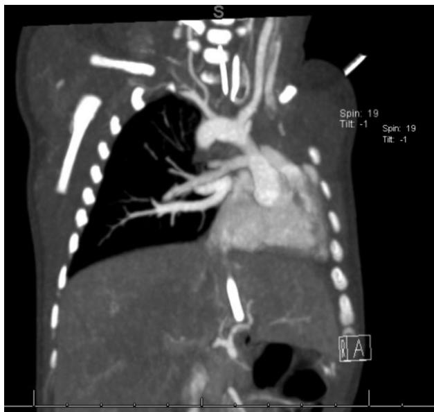
Fig. 2 Computed tomographic angiogram of first case confirming absence of left lung and absent left pulmonary artery.

Case 2: Preterm infant with prenatal diagnosis of ventriculomegaly, dextrocardia, left renal agenesis, and right lung agenesis.