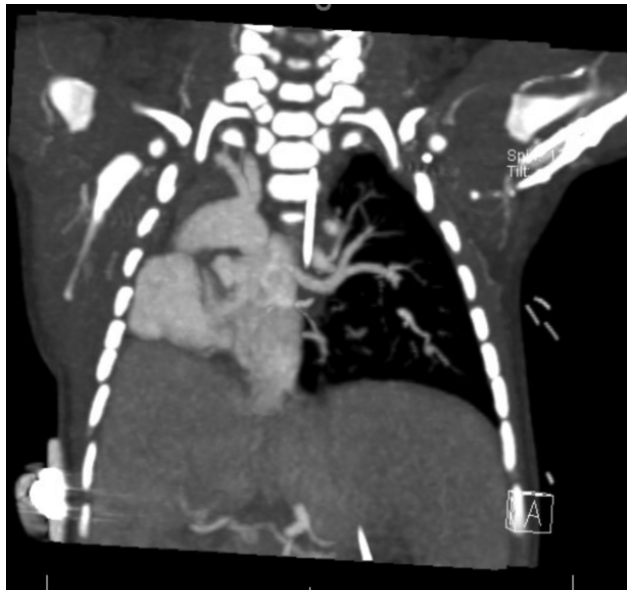
Fig. 4 Computed tomographic angiogram of third case confirming absence of right lung, along with aorta arising from right ventricle and left lung supplied from collaterals from descending thoracic aorta.

with the right lung agenesis was deemed inoperable by cardiology and cardiothoracic surgeons. After discussions with the family, his goals of care were changed to palliative care, and he was extubated to noninvasive ventilation on the fourth day of life. His clinical condition continued to deteriorate, and he died at 25 days of life. An autopsy was performed and confirmed the diagnosis of right lung agenesis, duodenal atresia, as well as multiple cardiac findings including dextrocardia, complete AV septal defect, aorta arising from right ventricle, anomalous pulmonary venous return, and single major left-sided aortopulmonary collateral artery branching from mid-descending aorta to the left lung hilum.