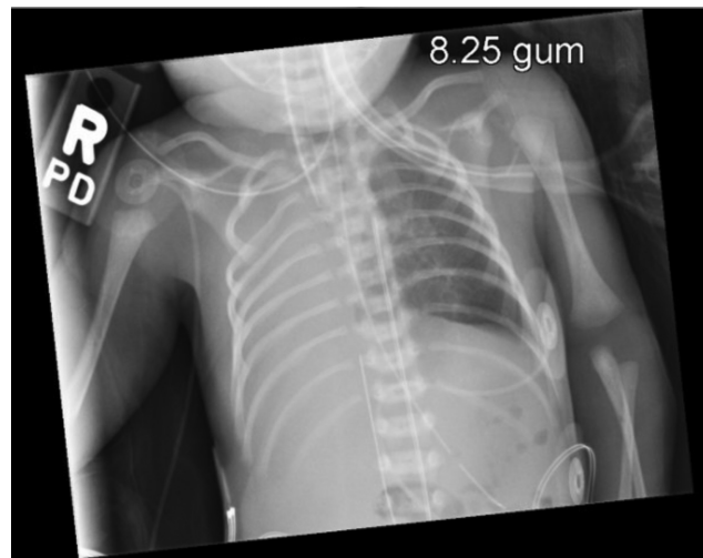
Fig. 3 Chest X-ray of second case showing total opacification of right lung.

A preterm male born at 32 weeks and 5 days with prenatal concerns of cerebral ventriculomegaly, dextrocardia, hypoplastic/aplastic right lung, single right pelvic kidney, left renal agenesis, and mild IUGR. He was intubated at birth for severe respiratory distress. Chest X-ray showed opacification of right hemithorax with a rightward shift of mediastinum (► Fig. 3 ). CTA revealed an absent right lung, right mainstem bronchus, right pulmonary artery, and right pulmonary veins. Flexible bronchoscopy performed while on ventilator showed complete tracheal rings and ongoing collapse. He underwent a sliding tracheoplasty, left pulmonary vein repair, and left pulmonary artery plasty on cardiopulmonary bypass. The postoperative period was complicated by the need for venoarterial extracorporeal membrane oxygenation due to severe pulmonary hypertension and the inability to ventilate. He remained critically ill with refractory shock needing multiple inotropes and hydrocortisone. With continued clinical deterioration, he developed anasarca refractory to fluid restriction and diuretics. Due to his worsening condition, the family made a loving decision to withdraw extraordinary measures at 38 days of life and declined an autopsy.