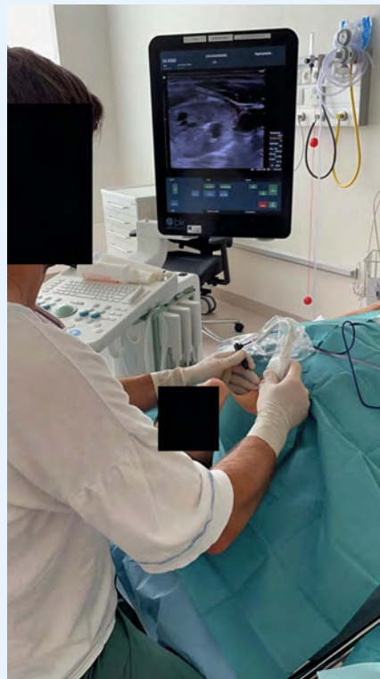
► Fig. 2 Setup in RFA treatment. RFA is done as a sterile procedure, and the physician is at the head end, with the ultrasound in one hand and the RFA electrode in the other hand.

The radiofrequency ablation technique was developed in South Korea and has spread to several European countries in recent years, and is also recommended by the European Thyroid Society, ETA [5]. Copenhagen University Hospital – Rigshospitalet (CUH-RH) is the first center in the Nordic Countries to offer treatment of thyroid adenomas with radiofrequency ablation. Over the past two and a half years, more than 80 patients have been treated at the department of otolaryngology at CUH-RH. Patients are offered inclusion in a study of self-reported thyroid related quality of life using the THYPRO questionnaire. Measurements are done before treatment and 3 months and 1 year after the treatment.