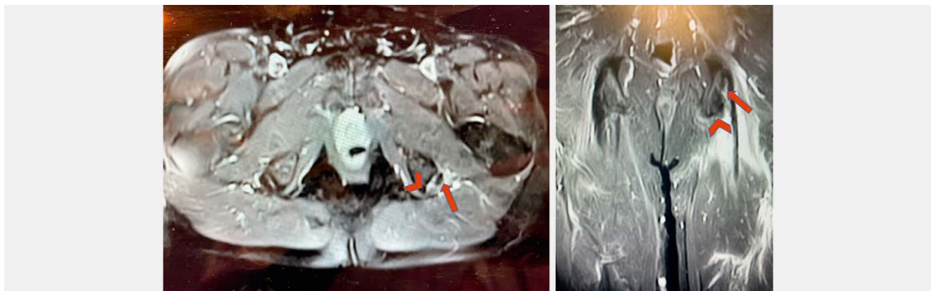
► Fig. 1 Axial (left) and coronal (right) STIR MRI image of a left-sided single conjoint tendon-only tear. The arrowhead demonstrates the bare footprint of the conjoint tendon on the ischial tuberosity with associated edema. The semimembranosus tendon can be seen inserting more laterally and anteriorly (arrow).

All patients underwent standardized physical therapy treatment in addition to activity modification. This entailed focus on pain and inflammation control during the first three weeks following diagnosis. At three to six weeks, they began to work on restoring range of motion and gait in addition to recruiting intact muscles such as the gluteal muscles, adductors, and abductors. At 10+ weeks, patients could return to sporting activity as allowed safely based on mechanics and physical therapy evaluation.