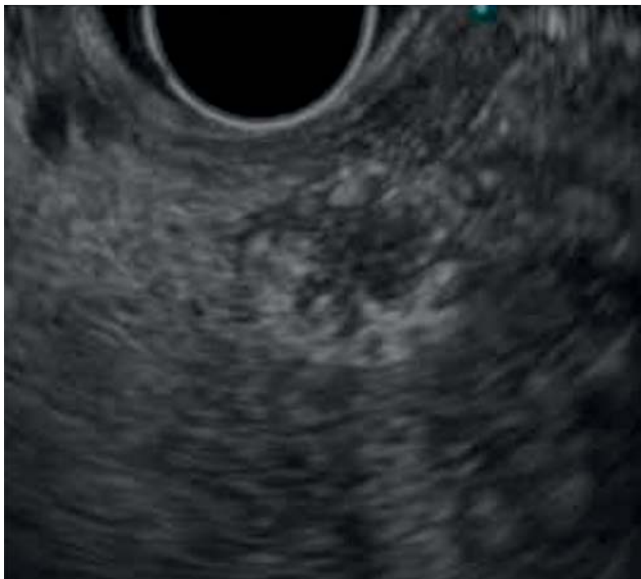
► Fig. 2 Final result, immediately after EUS-RFA application.