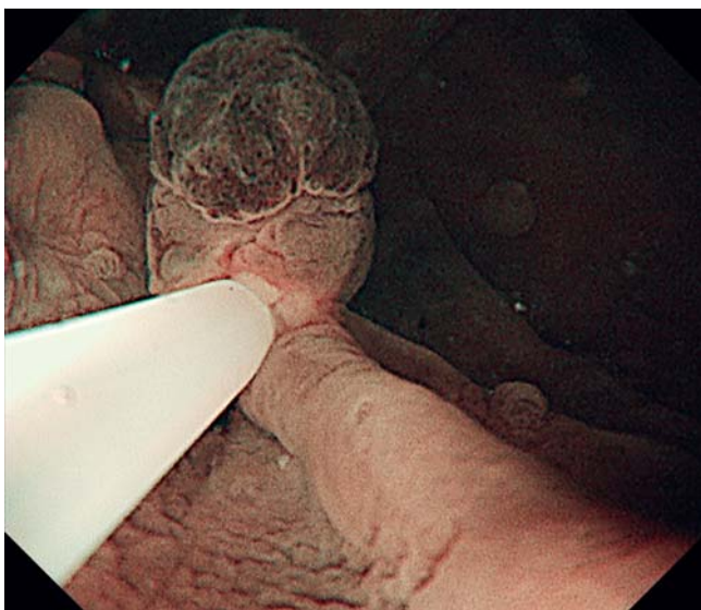
► Fig. 2 The lesion and a sufficient surrounding margin were captured with the snare.

sion morphology, size, and location as well as patient background. In principle, protruding lesions <20 mm and located at the greater curvature were indicated for UEMR, which facilitates achieving R0 resection for such lesions. In addition, UEMR is considered preferable for patients at high risk of complications, such as old age or severe comorbidity. All patients were followed up after discharge. Written informed consent for endoscopic treatment was obtained preoperatively from all patients. This study was reviewed and approved by each institutional review board. Informed consent for participation to this study was obtained in the form of an opt-out on the website.