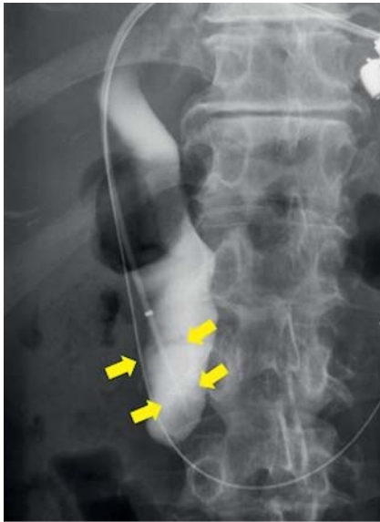
► Fig. 3 The endoscopic sheath was inserted into the bile duct and advanced directly above the stricture (yellow arrows).