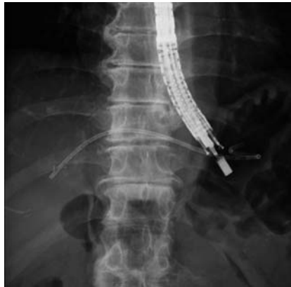
► Fig. 5 A 7F 14-cm plastic stent was placed.