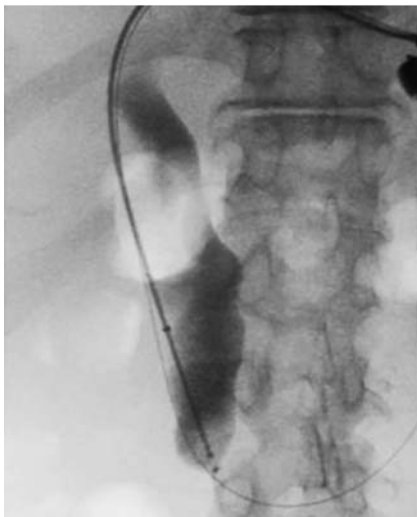
► Fig. 4 The biopsy forceps (Radial Jaw 4 Pediatric; Boston Scientific, Natick, Massachusetts, United States) was inserted, and five biopsies were performed.