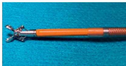
▶ Fig. 1 The biopsy forceps (Radial Jaw 4 Pediatric; Boston Scientific, Natick, Massachusetts, United States; inner diameter 1.8 mm) inserted into an endoscopic sheath (Endosheather; Piolax Medical Devices; outer diameter 7.2F (2.4 mm); inner diameter 2.06 mm).

▶ Video 1 Transmural antegrade biopsy was performed using an endoscopic sheath. After puncturing the intrahepatic bile duct using a 22-gauge FNA needle, a distal bile duct stricture was confirmed. The endoscopic sheath was inserted and advanced directly above the stricture. The biopsy forceps was inserted, and five biopsies were performed. All five biopsies were performed within 5 minutes after the endoscopic sheath insertion. Finally, a 7F, 14-cm plastic stent was placed.