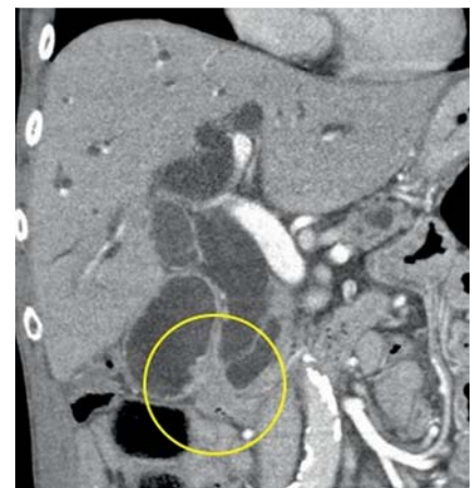
▶ Fig. 2 Computed tomography showed bile duct and pancreatic duct dilation. However, no obvious tumor could be identified (yellow circle).

tion revealed adenocarcinoma. After malignancy confirmation, we placed metal stents via a hepaticogastrostomy fistula (▶ Fig. 6). This method is promising because it is simple, and it is easy to perform multiple biopsies during EUS-guided hepaticogastrostomy with little concern for bile leakage.