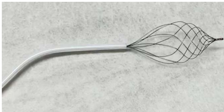
► Fig. 1 Novel RASEN basket catheter. The tip of the basket has a dense structure. The basket is very effective for removing small biliary stones.

A 69-year-old man with unresectable cholangiocarcinoma was admitted to our hospital owing to obstructive jaundice. At first, the inside stent was inserted in the anterior segmental branch for treatment of obstructive jaundice. However, he underwent endoscopic retrograde cholangiopancreatography 7 days later for additional biliary stent insertion in the posterior segmental branch owing to insufficient improvement in his jaundice symptoms. Although the posterior segmental branch was easily contrasted, the bile duct stricture was severe and required dilation using a thin balloon catheter (6-mm REN; Kaneka Medical). When insertion of the second biliary stent was attempted, the first stent migrated to the anterior segmental branch, and not only the distal end of the stent but also the nylon thread attached to the inside stent were not visible on the endoscopic image (► Fig. 2a, b ). We attempted to retrieve the migrated inside stent using the RASEN basket catheter. We inserted and opened the basket in the common bile duct and pulled it while slowly rotating it. Subsequently, we could easily grasp the nylon thread (► Fig. 2c ) and gently pull it. After returning the stent position without breaking the nylon thread, we released it in the duodenum. Finally, the second stent was inserted into the posterior segment branch without migration of the first stent (► Fig. 2d, ► Video 1 ). The RASEN basket