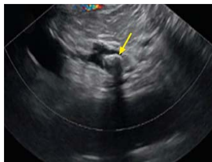
► Fig. 1 Endoscopic ultrasonography image showing main pancreatic duct (MPD) dilatation, with a large MPD stone (arrow) giving an acoustic shadow.

A 50-year-old man with chronic alcoholic pancreatitis was admitted to our hospital with upper abdominal pain and weight loss (8 kg in 5 months). Abdominal ultrasonography and endoscopic ultrasonography (EUS) revealed dilatation of the main pancreatic duct (MPD) up to 13 mm, narrowing of the terminal part of the MPD to 2 mm, and a pancreatic stone (18×12 mm in size) located 10 mm above the orifice (► Fig. 1 ).