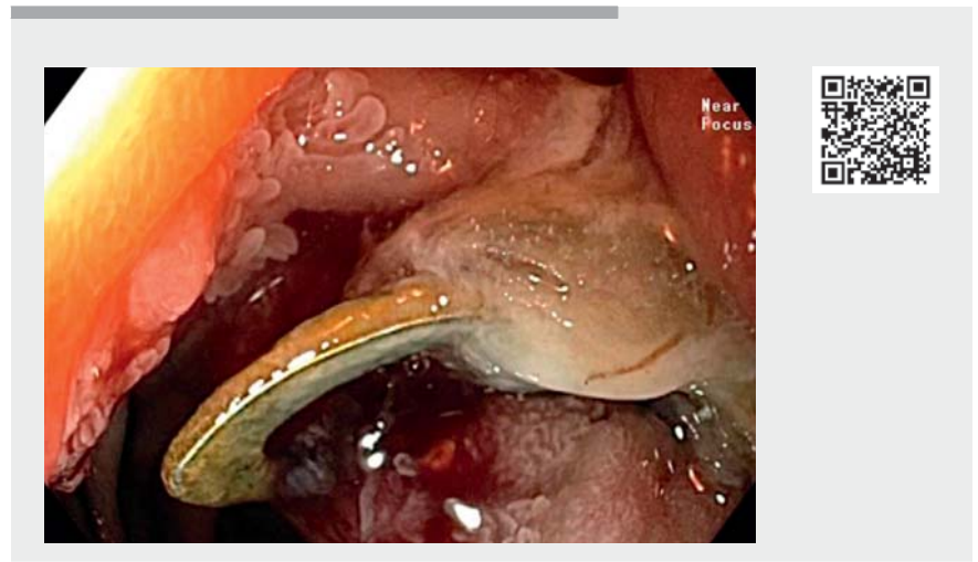
► Video 1 Diagnosis, treatment and follow-up of actinomycosis associated with a permanently implanted duodenal over-the-scope clip.

Follow-up esophagogastroduodenoscopies showed no signs of recurrence. Biopsy specimens of the scar revealed regenerative mucosa with hyperplastic changes. Both OTS clips stayed in place for 8 years, after which spontaneous dislodgement of one OTS clip occurred. Endoscopic examination then revealed a non-dysplastic mucosal bridge – double lumen appearance of the duodenum – with one clip still correctly placed.