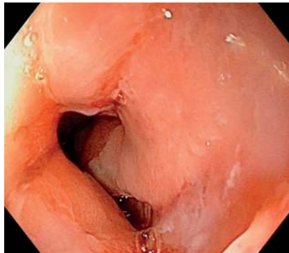
► Fig. 5 Complete healing of the distal ulcer esophagus 2 weeks after its identification.

Peroral endoscopic myotomy (POEM) is a safe technique for achalasia management [1]. The rate of major complications is commonly <5% in the largest series [2–4]; delayed bleeding with intratunnel hematoma (<0.5%) is infrequently reported. Hematoma and local compression effects can induce ischemic phenomena with ulceration, as well as hemodynamic effects triggered by active bleeding. Symptoms begin within 24–48 hours, generally with hematemesis and progressive retrosternal pain after several hours of active bleeding. If suspected, urgent chest computed tomography (CT) can confirm the diagnosis [5]. This complica-