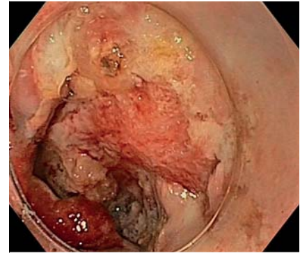
► Fig. 3 An ulcer in the distal esophagus, secondary to ischemic phenomena.