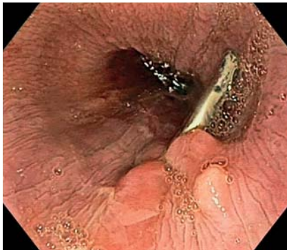
► Fig. 4 The middle esophagus 3 weeks after peroral endoscopic myotomy.