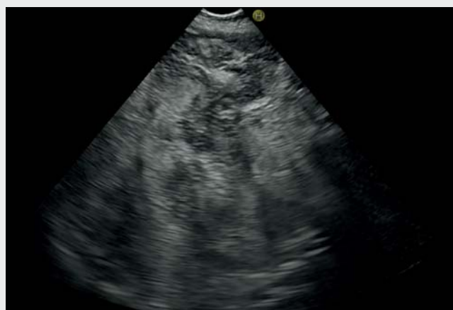
► Video 1 B-mode video of endoscopic ultrasound with bronchoscope shows a 5.5-cm mass characterized by heterogeneous echogenicity. In particular, the alternation of thick linear hyperechoic with iso-hypoechoic areas confers the mass a “zebra-like” appearance.

medullary hematopoiesis, thoroughly demonstrated in our video, might help the operator reliably suspect it in the correct clinical and radiological setting.