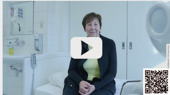
► Video 1 Film with sample dialog.