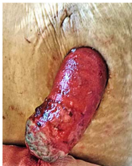
► Fig. 1 Stoma prolapse.

Stoma prolapse is a common late complication that occurs in 2–26% of colostomies [1]. Prolapse is most frequently seen after loop colostomies [2] and often involves the distal limb [3]. Prolapsed stoma is rarely incarcerated or strangulated; however, such cases require emergency surgery [3, 4].