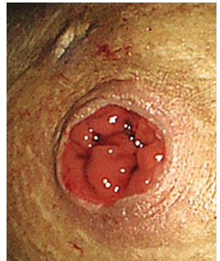
► Fig. 4 Successful reduction of stoma prolapse.