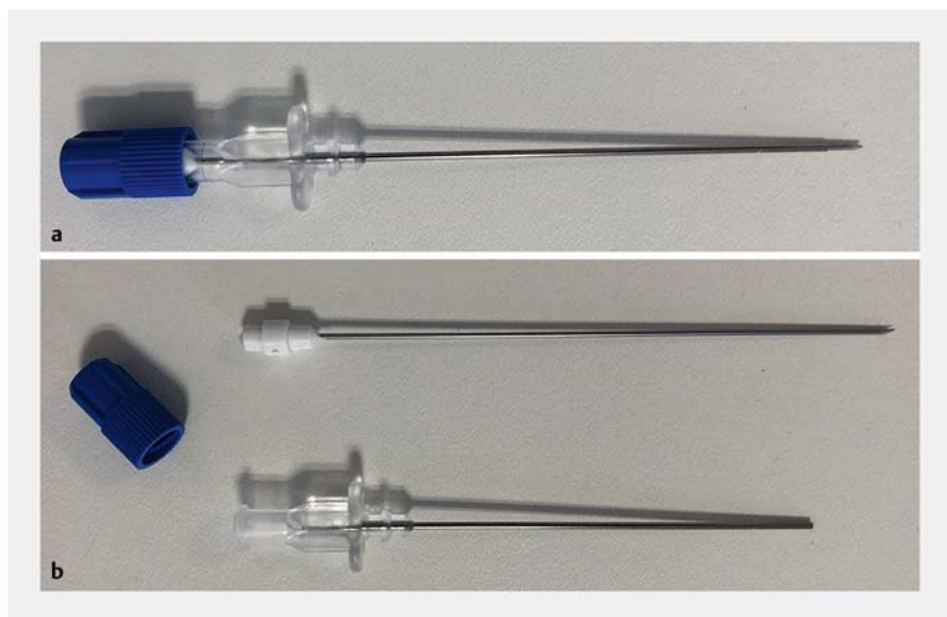
► Fig. 1 a Paracentesis catheter. b Inner needle and blunt-tipped fenestrated catheter.

computed tomography (CT) scan, adequate colon fastening to the abdominal wall was confirmed. He had suffered no recurrences 5 months post-procedure. Currently percutaneous endoscopic sigmoidopexy is an accepted treatment for recurrent sigmoid volvulus in patients like ours [1, 2]. Consequently, we propose