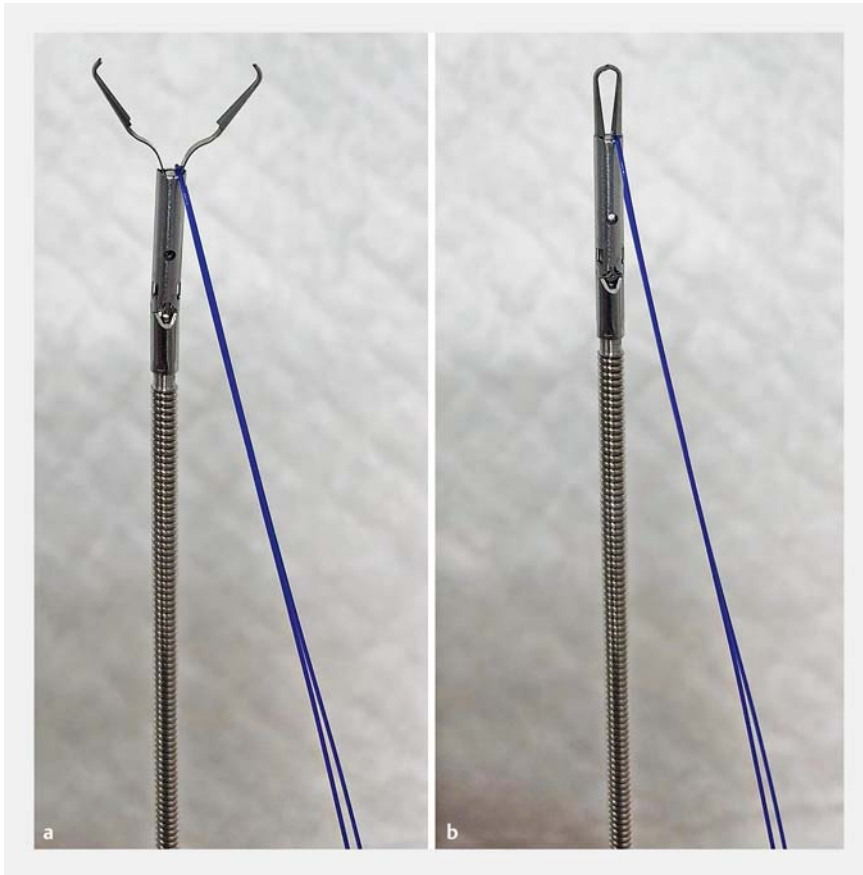
► Fig. 2 Resolution 360 clip (Boston Scientific) and 2/0 polypropylene-polyethylene monofilament (Optilene, Braun). a The suture thread loop has been pulled back to the base of the open clip. b The thread loop is firmly caught when the clip is closed.