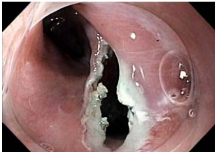
► Fig. 4 Endoscopic image of the tunnel entry after completed myotomy.