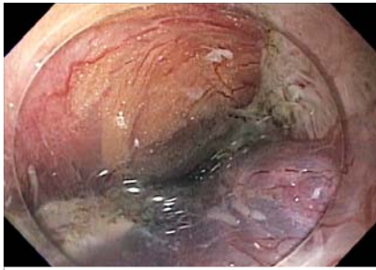
► Fig. 3 Endoscopic image of the tunnel after a complete myotomy.