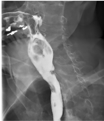
► Fig. 6 Water-soluble esophagogram after Z-POEM.