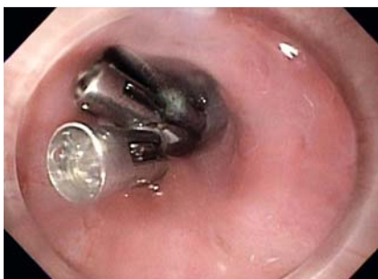
► Fig. 5 Endoscopic image of the tunnel entry after closure with clips.