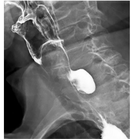
▶ Fig. 2 Zenker's diverticulum on esophagram.

pushing the esophageal edge of the entry down toward the esophagus as this approach can make the tunnel closure more difficult. Instead, a "precut" was performed by starting to divide the cricopharyngeal muscle before entering the tunnel.