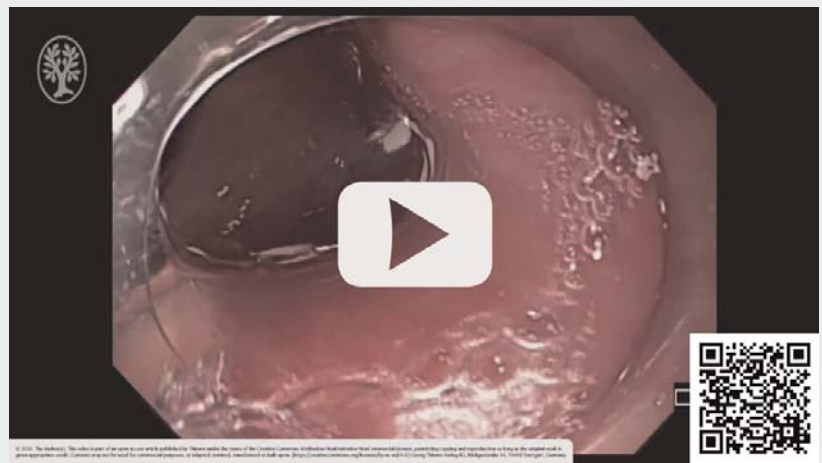
▶ Video 1 A modified Z-POEM with a "precut" myotomy.