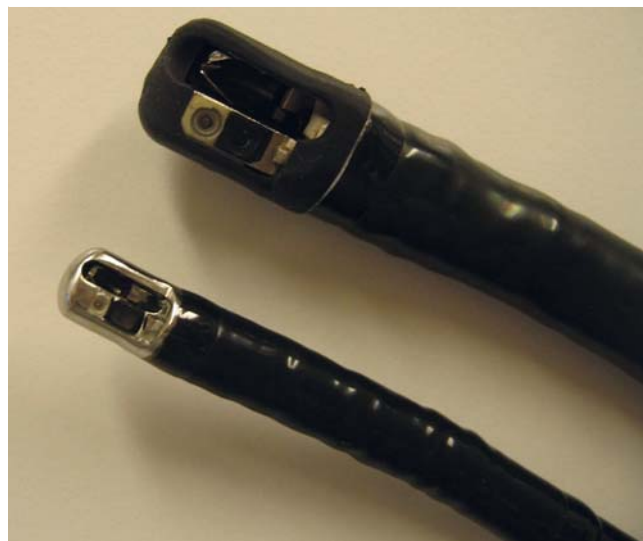
► Fig. 1 A pediatric duodenoscope (PJF160) alongside a standard TJF160R Olympus duodenoscope (top).

A total of 244 procedures were performed in 158 children. Patient age ranged from 8 days to 17.9 years (mean 8.8 years, SD 6.43). Patients' weight ranged from 2.9kg to 83.0kg (mean 32.8kg, SD 24.9) (missing data from 38 procedures). 56 procedures were performed in 53 infants ( \leq 1 year, mean age 3 months, SD 0.22). Mean weight in infants was 5.0kg (range 2.9kg to 9.0kg, SD 1.4) (missing data from 6 procedures). Two infants underwent 2 and 3 procedures, respectively. Both underwent ERCP due to biliary leakage, one after liver transplantation and one spontaneous. 188 procedures were performed in 105 children between ages 1 to 18 years. ► Table 1 shows the age distribution. Several patients underwent more than one procedure (► Fig. 2). In two procedures in infants and 38 procedures in children the patient had a Roux-en-Y anatomy with hepaticojejunostomy.