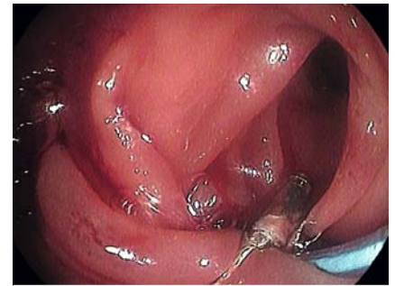
► Fig. 2 Wall defect after endoloop-assisted clip closure.