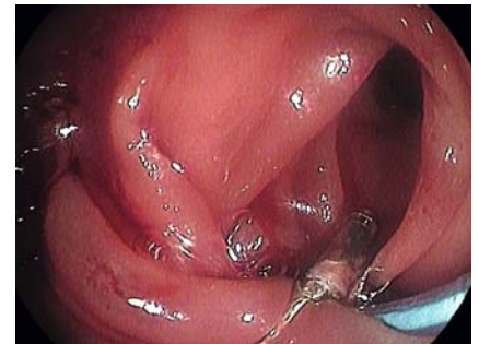
► Fig. 2 Wall defect after endoloop-assisted clip closure.