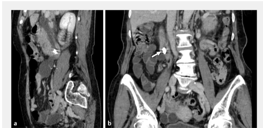
► Fig. 1 Computed tomography scans showing: a on sagittal view, dilatation of the main biliary duct and the presence of a foreign body in the peripapillary area; b on coronal view, the presence of a foreign body in the peripapillary area (arrow).

Foreign bodies may lead to a wide variety of complications, although the majority of foreign bodies will be passed spontaneously; among the elderly, the most common object is a dental prosthesis [1]. To the best of our knowledge, this is the only reported case of an impacted denture causing jaundice. We are unable to explain the possible way in which the denture could have got into the papilla, although such an occurrence is known to be possible because there are other reports of foreign bodies in the biliary tract, including toothpicks and surgical clips [2–4]. The speculated mechanism is reflux from the duodenum [5]. In this case, the sphincterotomy led to a fast resolution of the biliary obstruction and the patient was discharged a few days later. Because the majority of the ingested foreign bodies are unintentional and asymptomatic, the true incidence is diffi-