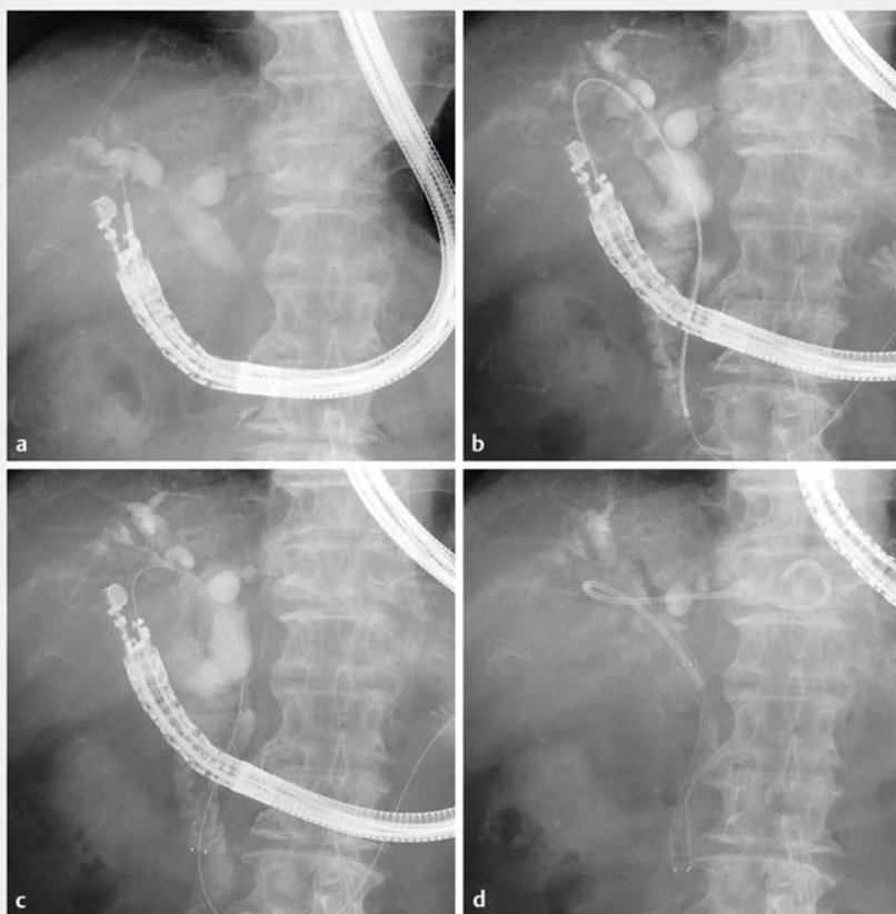
► Fig. 2 a The angle between the right hepatic bile duct and puncture route was extremely acute. b A 5.4-Fr ultrathin flexible delivery system was inserted into the bile duct. c The metal stent was placed antegrade across the bile duct stricture. d A dedicated single-pigtail stent was placed from the hepatic duct to the stomach.