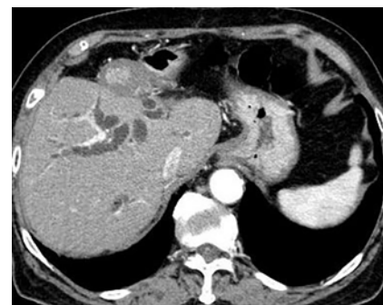
► Fig. 1 Abdominal computed tomography revealed the right intrahepatic bile duct dilatation, without the left lobe.

The ultrathin flexible metal stent delivery system may facilitate AS through EUS-HDS. This procedure may be a useful option for treating malignant biliary obstruction in patients with failed ERCP who require an approach via the right intrahepatic bile duct.