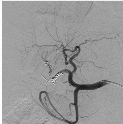
► Fig. 1 Angiographic image in a 78-year-old man with rupture of a cystic artery pseudoaneurysm into the common bile duct, 1 month after undergoing a laparoscopic cholecystectomy, that was treated with coil embolization.

The patient was re-referred with obstructive cholangitis 1 month later (► Fig. 2 ), but endoscopic retrograde cholangiopancreatography (ERCP) failed owing to a bile duct stricture that could not be passed. We then performed percutaneous transhepatic biliary drainage to gauge the stricture over the course of a year (► Fig. 3 a ). We removed the drain after 1 year with correct sizing of the stricture, but cholangitis subsequently recurred, requiring further percutaneous drainage prior to performing percutaneous cholangioscopy (CHF type V choledochoscope; Olympus, Tokyo, Japan). During cholangioscopy, we identified coils that had migrated into the CBD and easily removed these by pushing them