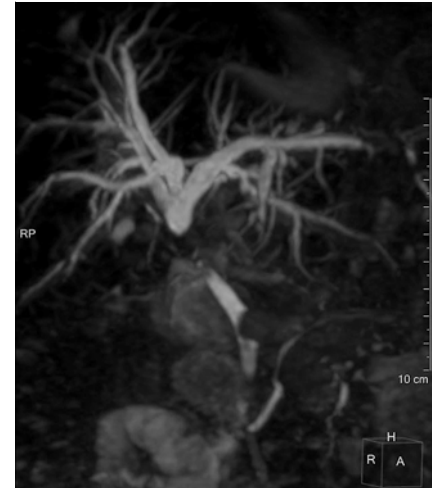
► Fig. 2 Biliary magnetic resonance imaging performed after the patient developed obstructive cholangitis.

with a biopsy forceps into the duodenum (► Fig. 3 b ; ► Video 1 ). The patient was discharged with transhepatic drainage for an additional 3 months (► Fig. 3 c ). We hope that the removal of the coils will improve CBD healing, although we fear the development of an ischemic biliary stenosis.