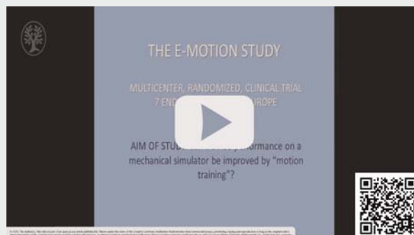
► Video 1 The Emotion Study: Motion training, theoretical briefing and cannulation attempts performed on the Boskoski-Costamagna ERCP trainer.