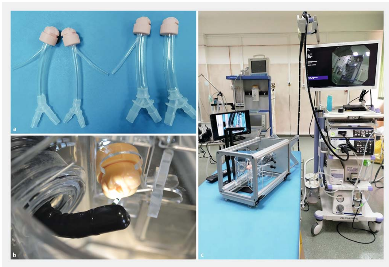
► Fig. 2 The Boškoski-Costamagna ERCP trainer (Cook Medical, Limerick, Ireland) a Non-biological cannulation models consisting of a papilla and biliopancreatic ducts in various anatomical designs (for easy, medium and difficult cannulation). b Cannulation attempt of the papilla using a standard duodenoscope and sphincterotome. c Complete simulator setup consisting of: endoscopy trolley, standard duodenoscope, the Boškoski-Costamagna ERCP trainer and simulated fluoroscopy unit with the aid of a HD camera and monitor

and it uses actual duodenoscopes and accessories, making it easy and convenient to use in variable teaching settings.