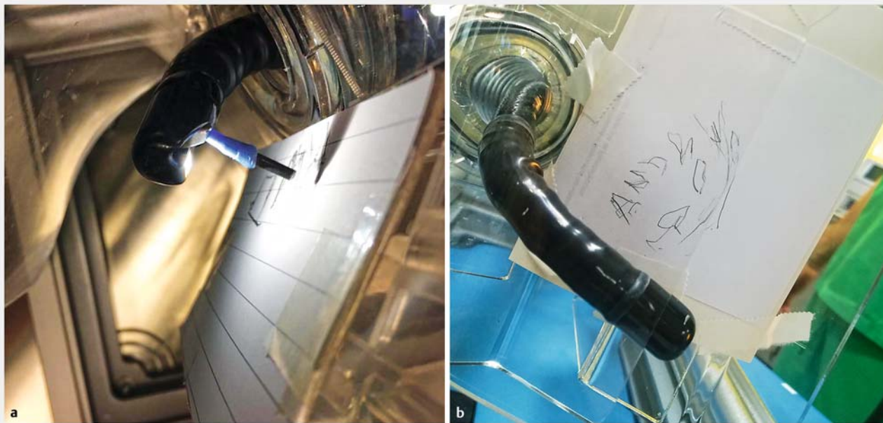
► Fig. 3 Motion training. Attempt at writing using a standard duodenoscope with a modified catheter with a graphite tip on a white piece of paper.