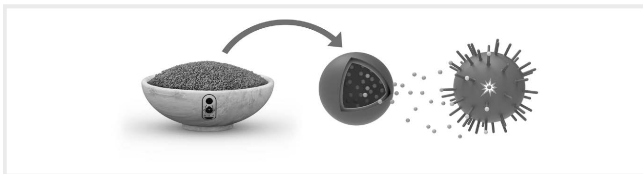
► Fig. 1 Left: Black cumin, discovered in Tutankhamun's tomb, is a valued ingredient in the Egyptian cuisine. Middle: Illustration of one principle applied in nanomedicine: a drug (small spheres) is loaded into a biodegradable capsule, which is enclosed by a second capsule. The function of the outer capsule is comparable to that of a time bomb, it dissolves at a certain time point to safeguard that the cargo is not dispersed prior to reaching the target organs. The inner capsule is engineered such that it binds to the target organ cells via chemical affinity. Once it has reached the target organ it releases its cargo. Right: The drug binds to the fusion spikes of SARS-CoV-2, thereby inhibiting its attachment to cells. This scenario needs a large number of drug molecules, where spikes and molecules need to have comparable dimensions. In a best case scenario, the drug molecules break through the spike shield, enter the interspike space, bind to the lipid envelope, and oxidize the virus. The probability for this event is controlled by the polarity contrast between drug, spike and lipid envelope as well as by the surface density of the coffin nail shaped spikes. These ports of attack are different from the standard drug docking target envisaged in Covid-19, namely the membrane-associated-angiotensin-converting enzyme 2 (ACE2) receptor: the port of entry of SARS-CoV-2. [7]. Binding to the viral spike and/or lipid envelope and oxidizing the virus, instead of blocking cell receptors is equivalent with minimizing the adverse effects of a drug – a novel pharmacological approach, which could be fully exploited by the use of nanomedicines designed according to the principles summarized in ► Fig. 2 . NB: ► Fig. 1 is a visual transcript of the title of our article.