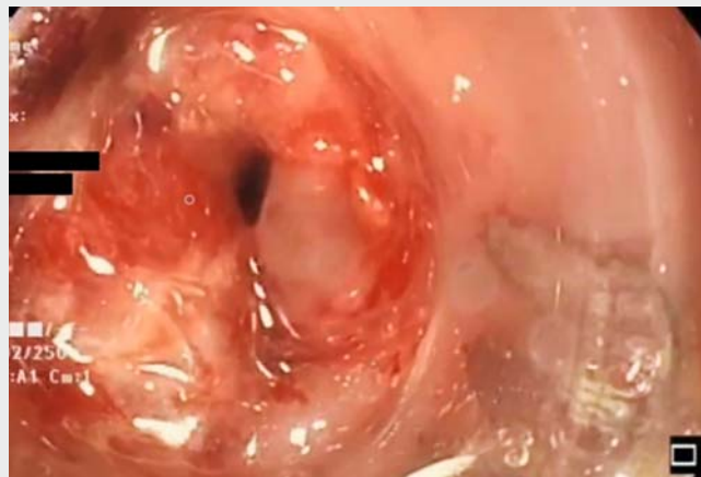
► Video 1 Early endoscopic closure of a perforated rectum using an OTSC after diagnostic colonoscopy.

as appropriate treatment of acute iatrogenic perforations as it reduces costs, avoids surgery in the management, and shortens the length of hospitalization [3].