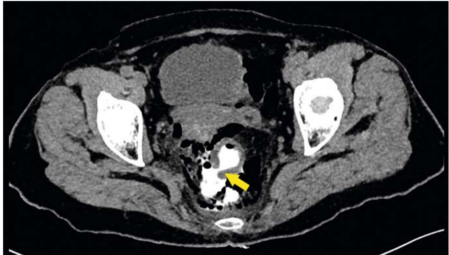
► Fig. 1 CT of the pelvis with rectal contrast, showing free air and extravasation of the contrast (arrow).

Delayed perforation after colonoscopy requires emergency surgery. In this case, the early detection of the perforation by CT made endoscopic treatment possible. A literature review of endoclips for the closure of acute iatrogenic perforations reported that endoclips are efficient in the management of iatrogenic perforations, especially when recognized early, although their efficiency may be limited in the case of large perforations [1]. In a randomized controlled porcine study, it was shown that an OTSC allows full-thickness closure of perforations [2]. The opposition forces of the OTSC provide strong securing which could be regarded