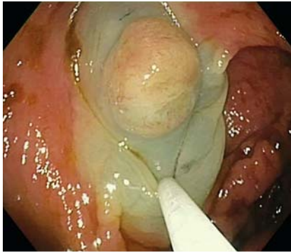
► Fig. 1 Sessile serrated lesion Paris 0-Is, NICE-1, in the right colon.

A 52-year-old man underwent screening colonoscopy. A sessile serrated lesion (Paris 0-Is, NICE-1; 17 mm diameter) was observed in the right colon. After submucosal injection with gelofusine plus indigo carmine, en bloc cold endoscopic mucosal resection (cold-EMR) was attempted using a 25-mm braided snare (SnareMaster SD-210U-25; Olympus, Tokyo, Japan) (► Fig. 1 ). After snare closure, moderate traction of the snare sheath was applied to remove the lesion; however, the lesion remained trapped due to a large amount of tissue caught. The snare was repositioned slightly, and resection was successful. On inspection of the mucosal defect, the submucosal layer was observed with apparent “bubble sign” after waterjet irrigation (► Fig. 2 a , ► Video 1 ), followed by a “double string” sign, suggesting exposure of damaged muscle fibers (► Fig. 2 b ). After insufflation and water irrigation, these muscle fibers separated showing deep muscular injury with visible serosa (► Fig. 2 c ). The defect was immediately closed with endoscopic clips (► Fig. 2 d ). The patient was monitored for 4 hours and discharged with prophylactic antibiotics and no symptoms. No complications occurred. Histology confirmed a 21 × 12 × 2 mm specimen and suspicion of serrated lesion without dysplasia.