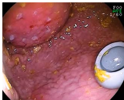
► Fig. 1 Endoscopic image showing a gastric port in the wall contralateral to the marked lesion.

Minimally invasive endoscopic procedures are associated with fewer adverse events and shorter hospital stays compared with surgery [1]. However, some advanced endoscopic procedures, including endoscopic submucosal dissection (ESD), require specialized training and significant experience to achieve competency and are not widely performed in non-specialist centers [2]. Despite the availability of a wide range of accessory devices, endoscopy lacks the dexterity required to achieve triangulation of instruments to perform non-axial tissue manipulation [3]. Because of the limitations of flexible endoscopes, a novel percutaneous intragastric trocar (PIT) has been designed. This device (Endo-TAGSS LLC, Kansas City, Missouri, USA) is placed using well-understood percutaneous endoscopic gastrostomy (PEG) techniques that have been performed by many physicians worldwide, with low rates of adverse events [4]. While previous studies have used this technique in intragastric procedures, in this video we demonstrate the use of the PIT device in both gastric and colonic ESD [5].