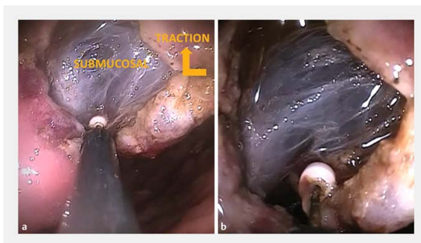
► Fig. 2 Images during endoscopic submucosal dissection with percutaneous intragastric trocar (PIT) assistance showing: a the use of a grasper through the PIT, which allows traction on the lesion to improve visualization and tissue tension to enhance dissection; b improved exposure of the submucosal layer.

Under endoscopic visualization, an intragastric port (3.8 mm/11 Fr) was placed in a fashion similar to that of a standard PEG in the contralateral wall of