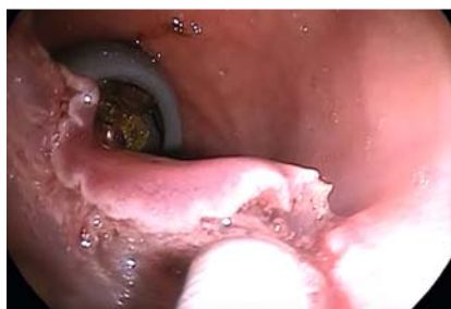
► Fig. 3 Endoscopic image showing colonic endoscopic submucosal dissection with percutaneous intragastric trocar (PIT) assistance.