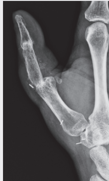
► Fig. 5 Postoperative radiograph at 18 months showing proximal and distal flap bone union.

No microvascular complications occurred after surgery. Radiographic bone union was achieved after 30 days, and the K-wire was removed. Radiographs were taken at 1–2–6–12–24 months (► Fig. 5 ). No signs of infection recurrence were reported during a 32-month follow-up (► Fig. 6 ). The patient underwent 3 months of hand kinesiologic therapy. At the end of rehabilitation Kapandji was 9 on the operated right hand (left hand, 10). Right hand