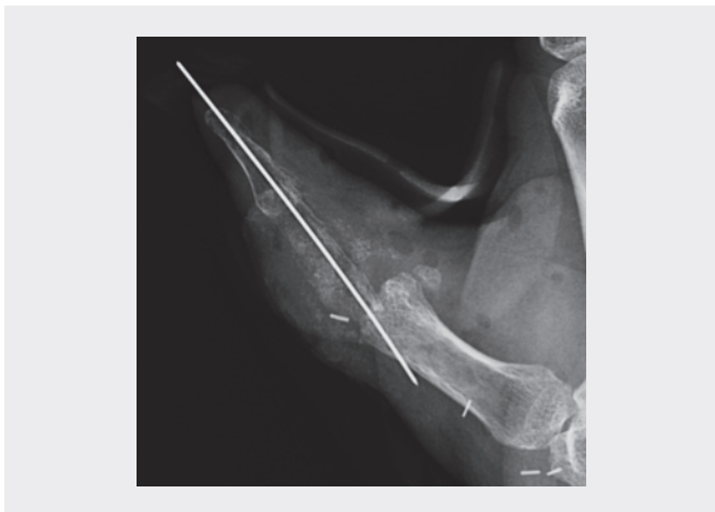
► Fig. 4 Immediately postoperative radiograph showing inset with one k wire.

cutaneous plane to reach the proximal recipient harvested vessels. The new phalanx was revascularized with end to side arterial anastomosis to the dorsal branch of radial artery and end to end venous anastomosis to a superficial tributary branch of the cephalic vein. At the donor site surgical incision a full thickness skin graft was obtained, and used for a tension free closure covering soft and perivascular tissues on the dorsal proximal aspect of the “neophalanx”.