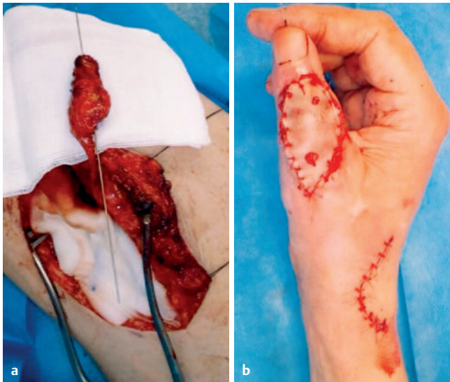
► Fig. 3 a Flap at donor site after remodelling with inserted one K wire; b thumb after inset with skin graft on dorsal aspect.