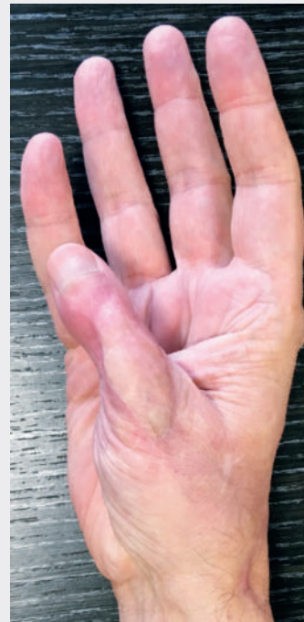
► Fig. 6 Clinical postoperative at 24 months.

grip strength was 28 kg. Biometric pinch strength was 0.83 kg (left 3.66 kg). Disabilities of the Arm, Shoulder and Hand score improved from 74.13 to 41.37 after surgery. No complications at donor site with full painless range of motion after 3 months. Minimal scar hypertrophy at the donor site without alteration of sensitivity.