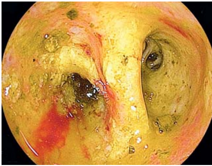
► Fig. 4 Endoscopic image after stone removal.