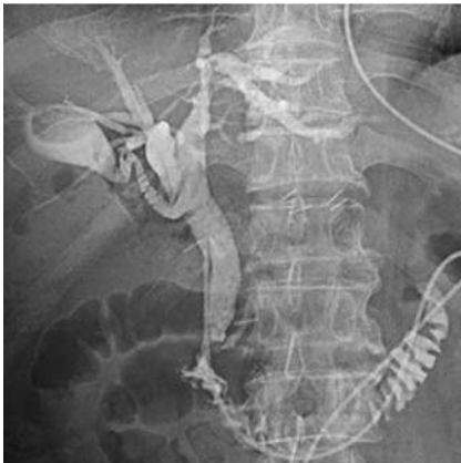
► Fig. 5 Cholangiogram from the endoscopic nasobiliary tube. The stones had been removed completely.