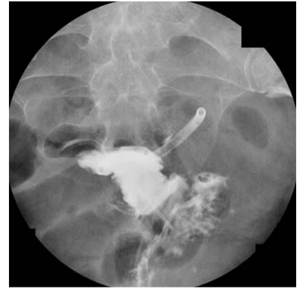
► Fig. 1 Fluoroscopic image showing a double-pigtail plastic stent draining a perirectal collection, and a metallic foreign body 4 cm in length close to the stent.