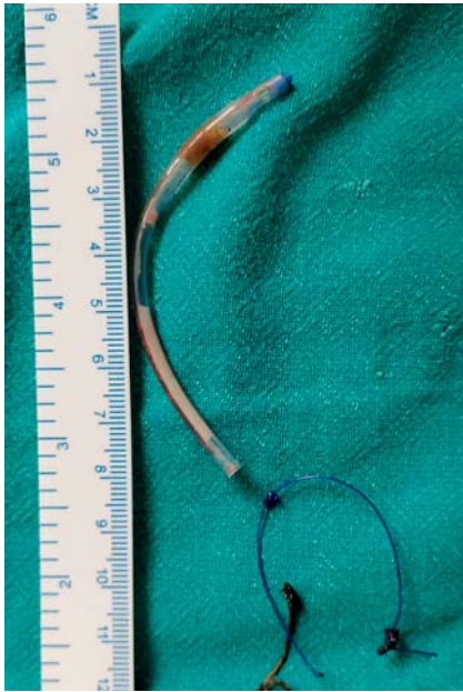
► Fig. 2 Photograph of the eroded silicone ring after its removal.