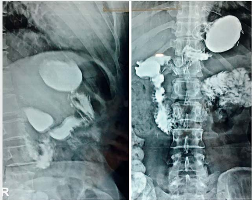
► Fig. 3 Radiographic images using oral Gastrografin taken on post-operative day 1 showing no evidence of leakage.