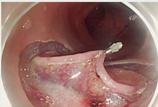
► Video 1 How to prepare a clip with a looped thread, and colorectal endoscopic submucosal dissection using the clip with looped thread method.

This counter-traction method has many advantages. No special tools or devices are necessary, and the procedure can be carried out without the removal and reinsertion of a scope. Additionally, this method is inexpensive, easy, and only requires 30 seconds to make one looped thread. The length of the thread can be adjusted according to the circumstances, and more clips or looped thread can be added as needed. We suggest that this counter-traction method may be one of the best traction methods for colorectal ESD.