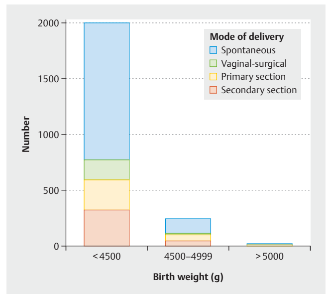
► Fig. 1 Representation of the mode of delivery in the weight classes 4000–4499 g, 4500–4999 g and \geq 5000 g. Primary and secondary sections were performed more frequently with an increasing birth weight.

All analyses were performed using IBM SPSS Statistics 25.0 (IBM, Armonk, New York, USA).