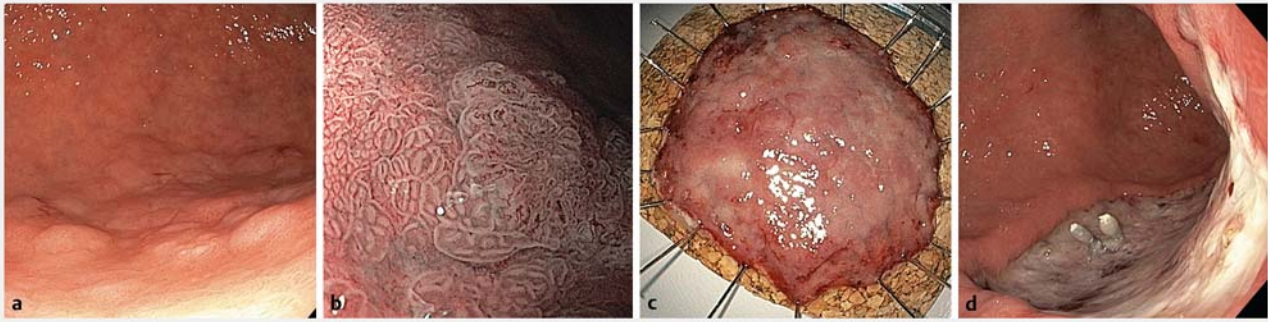
► Fig. 2 Endoscopic submucosal dissection (ESD) of early gastric cancer. a Localization of a 0-IIa/b lesion on the posterior side of the gastric body. b Detail of the lesion showing the lateral margin (narrow band imaging). c Resected specimen pinned on corkboard. d ESD wound on the day after the intervention showing a clear base ulcer. Final histopathology result was pT1a (m3), L0, V0, R0–G2 (intestinal type).

to close any suspected or visible microperforations (EZ clip, Olympus Medical Systems).