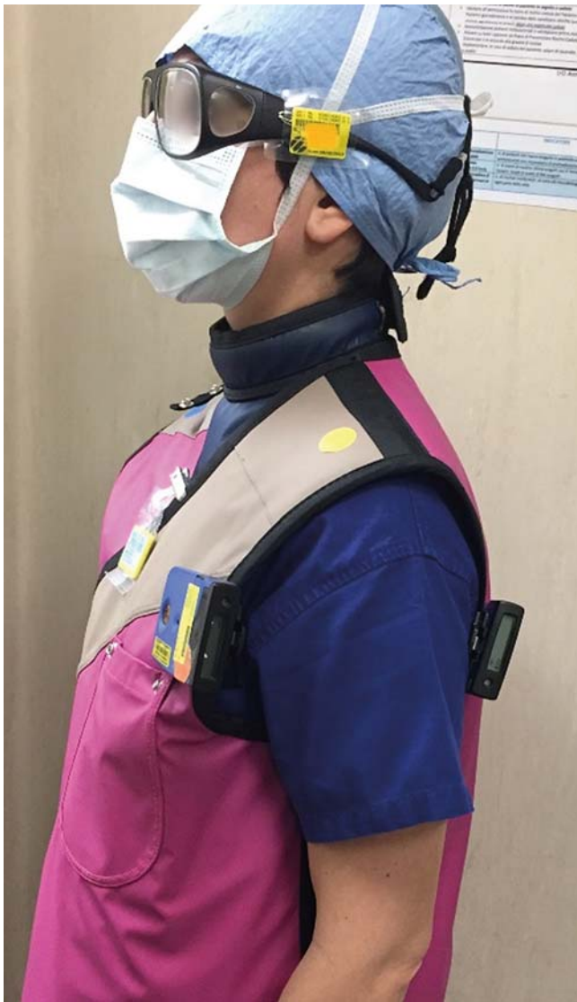
► Fig. 1 The two dosimeters were placed with one outside the lead apron at the left upper chest position of the endoscopist, and the other at the back, specular to the first.

Student's t tests, with statistical results considered significant at P values less than 0.05.