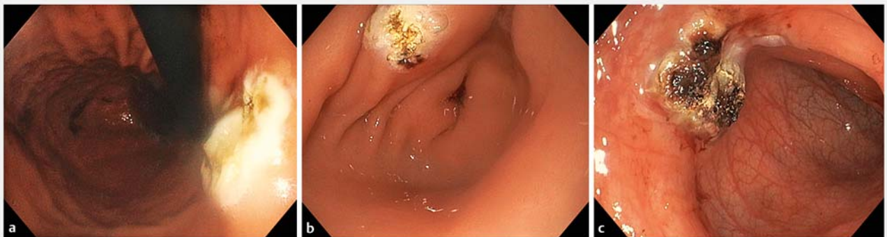
► Fig. 3 The lesions after treatment with argon plasma coagulation. a Gastric antral lesion. b Gastric pre-pyloric lesion. c Colonic lesion.