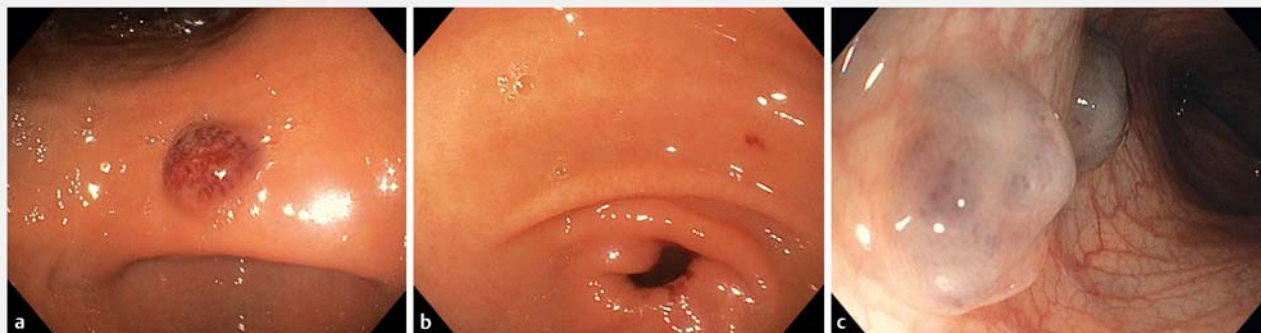
► Fig. 1 Endoscopic view of the angiomas. a Gastric antral lesion. b Gastric pre-pyloric lesion. c Colonic lesion.

► Video 1 Video capsule endoscopy diagnosis and double-balloon endoscopic sclerotherapy of gastrointestinal angiomas.