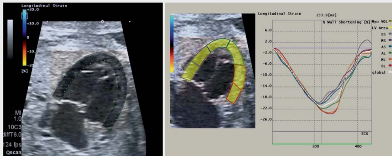
► Fig. 2 Apical four chamber view of a hypoplastic left heart syndrome (HLHS) fetus (mitral atresia/aortic atresia) at 26 + 5 weeks of gestation. Left: Traced myocardial wall of the right ventricle (RV) and interventricular septum for myocardial deformation analysis (strain) using 2D speckle tracking echocardiography. Right: Curves for RV and septal longitudinal peak systolic strain (%) of six segments of the myocardial wall and global strain (%) for one fetal heart cycle. BL: basal lateral, ML: middle lateral, AL: apical lateral, AS: apical septal, MS: middle septal, BS: basal septal. High values for RV global strain can be interpreted as a sign of RV remodeling leading to an adaptation of myocardial function to left ventricular conditions.

In a retrospective study of 84 HLHS fetuses using blood flow and tissue Doppler techniques, Natarajan et al. observed significantly elevated values with regard to the RV Tei index or myocardial performance index (MPI), a parameter of global ventricular function [33], with the values pointing to RV dysfunction in HLHS fetuses [20]. Moreover, the E/e' ratio used in adult echocardiography to record ventricular filling pressures showed elevated values in the HLHS group compared to healthy control fetuses [20]. This ratio is the ratio of blood flow velocity during early diastolic passive filling of the RV ( E ) and early diastolic myocardial relaxation rate in the region of the RV ventricular wall ( e' ). The higher the E/e' ratio (► Fig. 1 ), the greater the blood flow velocity in relation to myocardial movement, which in turn indicates an increased atrial pressure gradient and reduced relaxation capacity or compliance of the fetal myocardium [34].