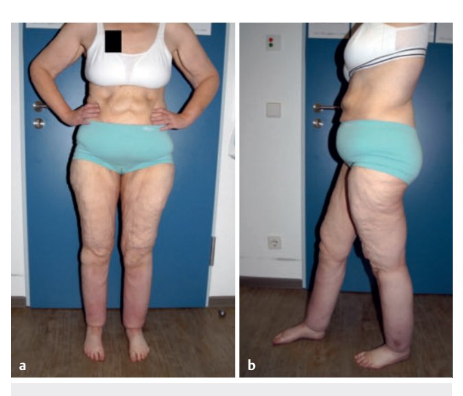
► Fig. 2 Patient from ► Fig. 1a and ► Fig. 1b, 14 months after gastric bypass surgery.

to convince the patient that the proposed liposuction would not achieve any significant and certainly not a permanent improvement and that bariatric surgery – embedded in a long-term overall concept – was the better alternative treatment. The patient agreed with our opinion and was prepared for a gastric bypass operation within the context of our multimodal obesity programme. Surgery was performed a few months after discharge from the Földi Clinic.