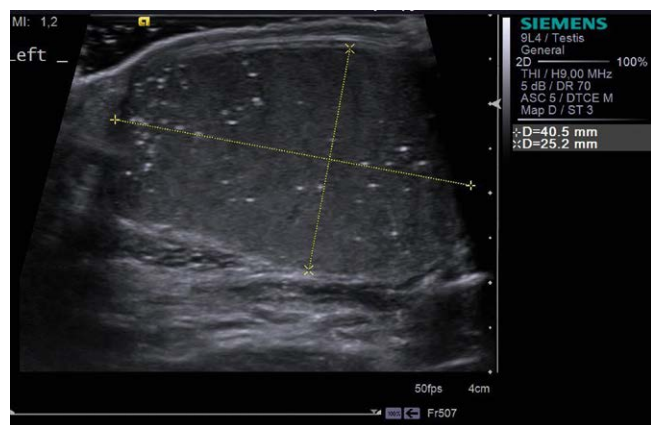
► Fig. 4 Ultrasound image of a testis with TML including volume measurements.

well with ultrasound measurements, even if ultrasound may slightly overestimate testicular volume [5, 20]. Another limitation is that comparison of testicular volume occurred between symptomatic patients and not between asymptomatic men from the general population. The proportion of patients with TML was high in the study population, but if the study population was e. g. twice as large, it may have been possible to show a significant difference between patients with and without TML, and not just a trend.