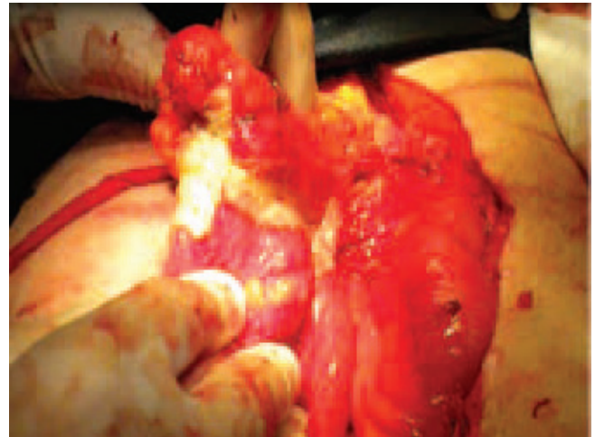
Fig. 4 – Final aspect of the functional termino-terminal ileo-transverse anastomosis in patient 4. In spite of the perfect technical condition and adequate protection with HFTP membrane, there was evolution to anastomotic dehiscence and death.

nificant rates of dehiscence. In recent years, developments in the field of colorectal surgery were mainly concentrated in staplers and disposable equipment mainly for laparoscopic techniques. Despite significant advances in this area, AD is found in a significant proportion of patients. Its consequences include reoperations, longer hospital stay and consequent increase in treatment costs, as well as the possibility of mortal-