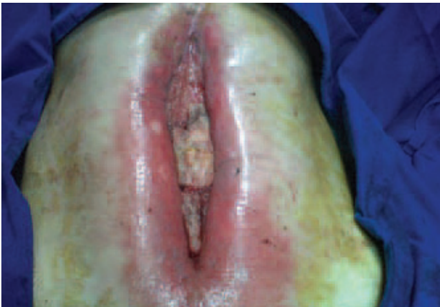
Fig. 3 – Final aspect of patient 3 after enteroanastomosis for enteric fistula closure in peritoneotomy area with HFTP protection.

nificant rates of dehiscence. In recent years, developments in the field of colorectal surgery were mainly concentrated in staplers and disposable equipment mainly for laparoscopic techniques. Despite significant advances in this area, AD is found in a significant proportion of patients. Its consequences include reoperations, longer hospital stay and consequent increase in treatment costs, as well as the possibility of mortal-