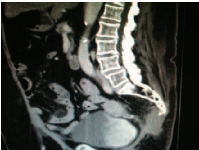
Fig. 1 – CT - sagittal view – tumor lesion aspect.

Positron-emission computed tomography (PET-CT) was performed, which showed areas of increased uptake in the presacral region, measuring 6.0 × 4.0 cm, with sacrococcygeal bone invasion, suggestive of neoplastic recurrence (Fig. 1). The carcinoembryonic antigen (CEA) was normal (0.2 ng / dL). It was then assumed that it was a recurrence of the primary lesion. Surgical resection was proposed and, at surgery, a new CT scan showed no evidence of distant metastases, disclosing the presence of the same lesion in the sacral region, with a slight increase in size (Fig. 2). Posterior approach was used for the surgical procedure and the lesion was resected together with the sacral vertebrae S4 and S5, with free macroscopic margins. Primary closure of the wound was performed. The patient recovered uneventfully and was discharged on the seventh postoperative day. Histopathological examination