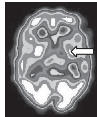
Fig 1B: SPECT scan of the same patient showing improvement in perfusion following six weeks treatment with piracetam.

Nothing however could be further from the truth. As recent research has shown 5 , patients with postconcussion syndrome have neuropathological, neurophysiological and neuropsychological changes overlaid with physical and emotional aspects which can make the management very complex and prolonged.