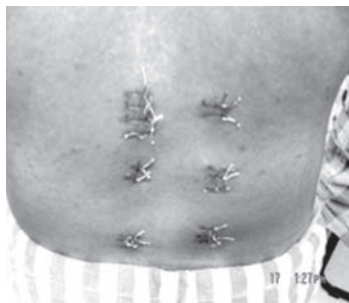
FIGURE 2 : Skin closure

Closure is accomplished with a few interrupted stitches in the fascia, a subcuticular skin suture and Dermabond/dressings.