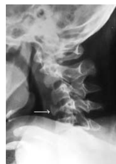
Fig 1: Plain Xray cervical spine showing burst fracture of C4 (arrow) with instability in flexion.

Daljit Singh Department of Neurosurgery G B Pant Hospital, New Delhi