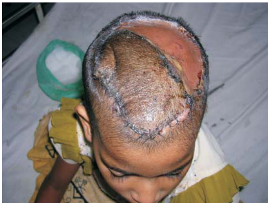
Fig 4: Postoperative photograph of the patient

and fungating brain matter visible. Debridement of the bone was done to define the dura. The infected portion of the dura was removed and stay sutures were applied. The fungated brain matter was excised followed by