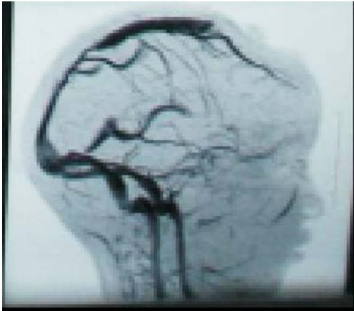
Fig 3: MR venograph of the patient showing thrombosed anterior third of superior sagittal sinus