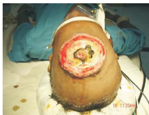
Fig 1: Clinical photograph showing the scalp wound

On examination she had 12 x 8 cm scalp loss with charred area on the vertex bone with foul smell and fungation of brain matter (Fig 1). There were no systemic signs and symptoms of meningitis or any other neurological deficit.