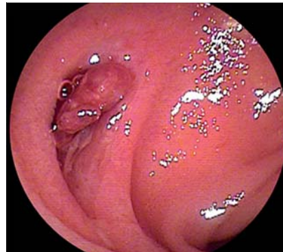
Fig. 2 Jejunal ulcer with visible vessel detected during an urgent DBE.

The overall diagnostic yield of DBE in OV was significantly higher in the urgent DBE group than in the non-urgent DBE group (70% versus 30%, P < 0.001 ). Active bleeding (spurting or oozing) was found in 20 (27%) patients with urgent DBE whereas there were only 3 (7%) identifiable active bleedings in the non-urgent DBE group ( P < 0.01 ). Bleeding sources in each group are shown in ● Table 2 . Ulcers were the most common bleeding sources; 27%